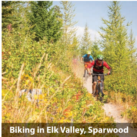
Biking in Elk Valley, Sparwood