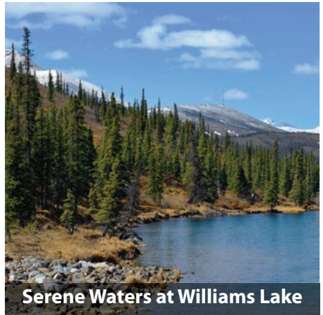
Serene Waters at Williams Lake

Exciting opportunities for FAMILY PRACTICE PHYSICIANS to service our welcoming communities. There are numerous opportunities to build the practice of your dreams from rural to urban with traditional full scope medicine, primary care, GP specialty, addiction care and more. Here you are likely to find the combination of services to build the practice and lifestyle you want. Work-life balance happens here!