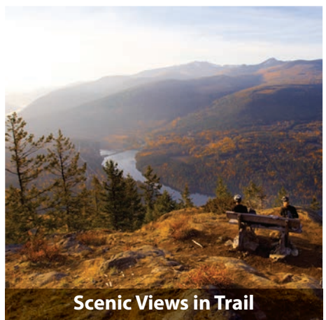
Scenic Views in Trail