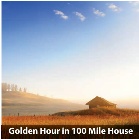
Golden Hour in 100 Mile House