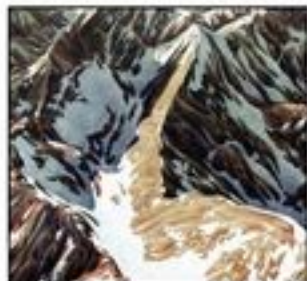
Above the Rockies #15 Watercolour on paper, 18" x 12" by Rene Thibault © 2006